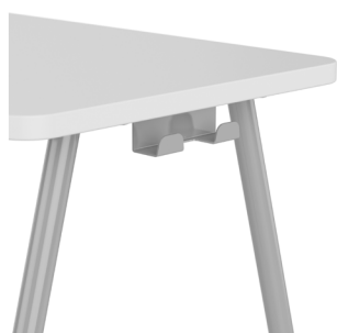
marker board/ book bag hook