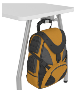
The heavy duty all steel hook supports both book bags as well as multiple personal marker boards.