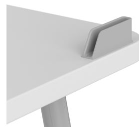
marker board dock

OVERALL DIMENSIONS 24" D x 60" W, 24" D x 72" W 30" D x 60" W, 30" D x 72" W