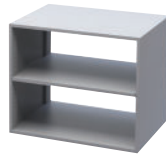
Double Storage Module