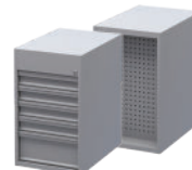
Tool Storage Module