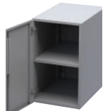
Single Storage Module with Locking Doors