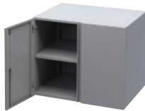
Double Storage Module with Locking Doors